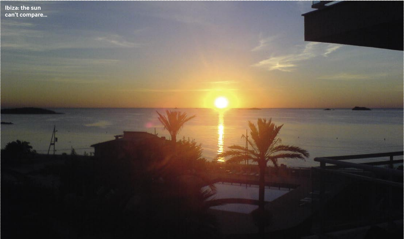
Ibiza: the sun can't compare...